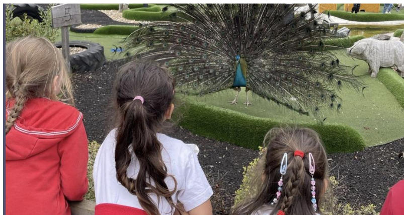
Farm school trip